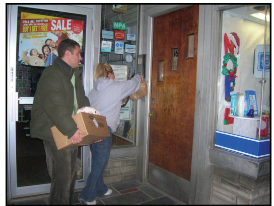
Above: Case Management staff ringing the door bell of an Aftercare Client to deliver a hot meal.