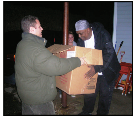
Left: Case Managers deliver food baskets to Aftercare Clients for the holidays.